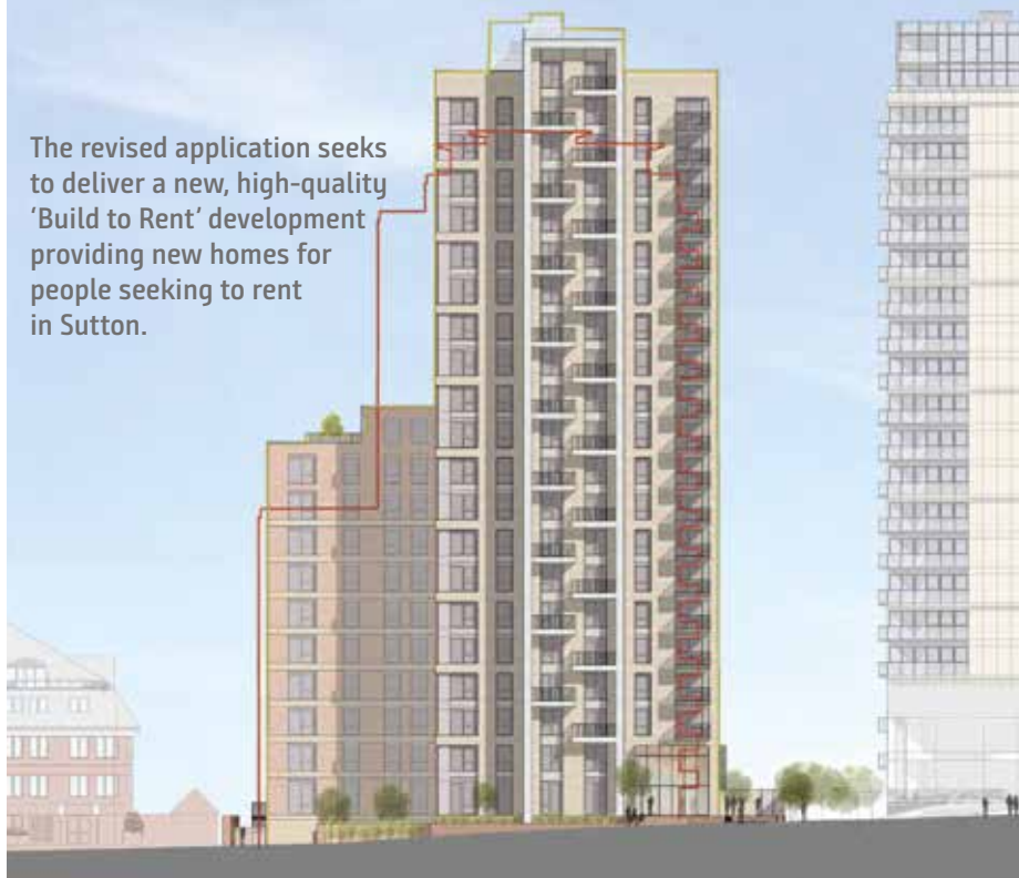
Comparison of the existing consented scheme with Watkin Jones' proposed scheme

The revised application seeks to deliver a new, high-quality 'Build to Rent' development providing new homes for people seeking to rent in Sutton.